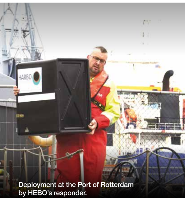
Deployment at the Port of Rotterdam by HEBO's responder.