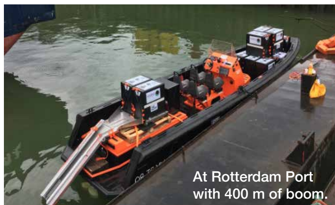
At Rotterdam Port with 400 m of boom.

H ARBO tested T-Fence™ at OHMSETT and offshore to validate its unprecedented oil containment capabilities. T-Fence™ has a 4.5 inch freeboard and an 8 inch draft. While its properties enable it to ride the waves efficiently, it weighs only 6.5 oz per foot. A cartridge holding a 25 m cartridge weighs 23 kg. Practically, no logistics are needed.